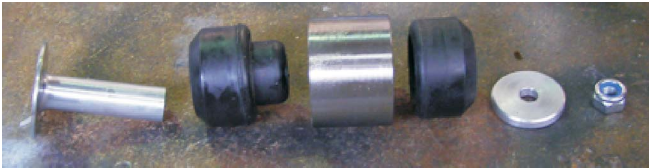
Weldable: 2 Top are "cups"